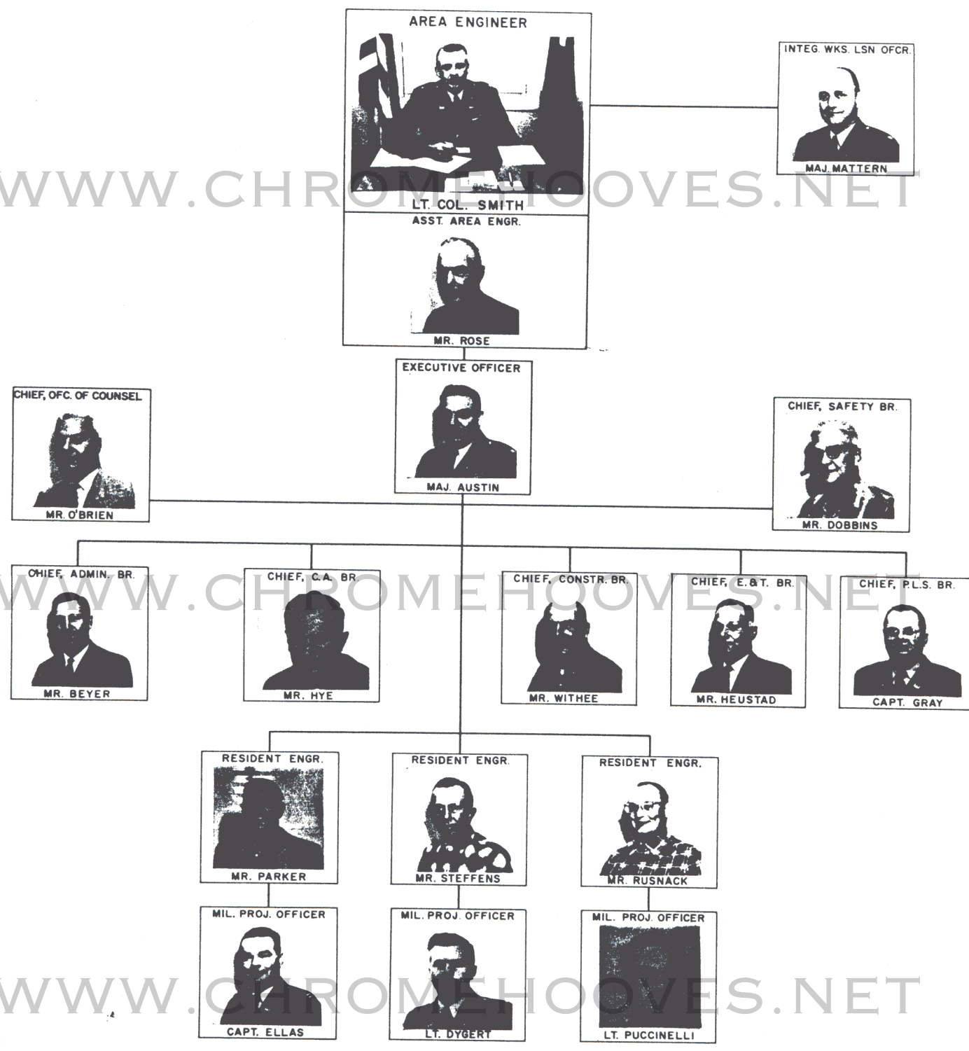
PICTORIAL ORGANIZATIONAL CHART